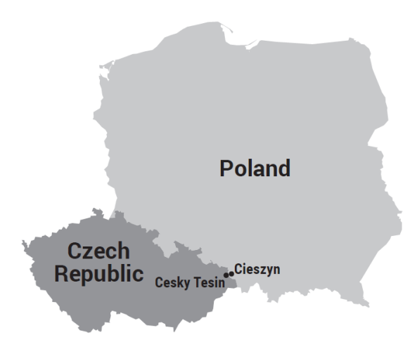
Figure 1. The location of the border cities Cieszyn-Česky Těšin.

and prevention. the cross-border conurbation of Cieszyn-Česky Těšin functions like a capital for the Euroregion [75]. the cooperation of the Euroregion was based on the "Cieszyn Silesia development strategy"; however, both cities have not yet prepared a bilateral strategy for cross-border cooperation.