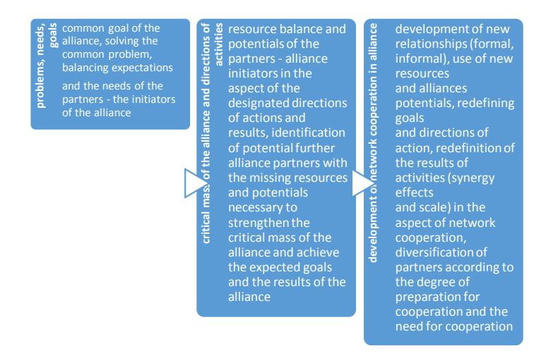
Figure 4. Activities related to the transformation of the cross-border bilateral alliance into a cross-border network alliance.

The key activities related to the transformation of the cross-border bilateral alliance into a cross-border network alliance are shown in Figure 4.