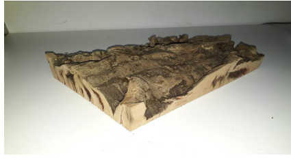
Fig. 1: Image of one of the pieces of the virgin cork with dimensions 0.3 x 0.2 m and where it is possible to observe its heterogeneity.