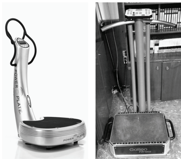
FIGURE 2: Power Plate and Galileo vibration platforms.

3.6.2. Performance on the Platform. The postures used in the four RCTs also varied. In three RCTs, patients maintained a static posture on the platform during vibration [28, 30–34], whereas, in the fourth RCT, patients performed both static and dynamic tasks during vibration [27, 29]. In two RCTs, both feet were always on the platform during vibration [27, 29–32], and, in the other two RCTs, some series were performed with only one foot on the platform [28, 33, 34]. The knee angle varied between 45° and 130° in the two static-task RCTs and between 90° and 180° in the dynamic-and-static-task RCT.