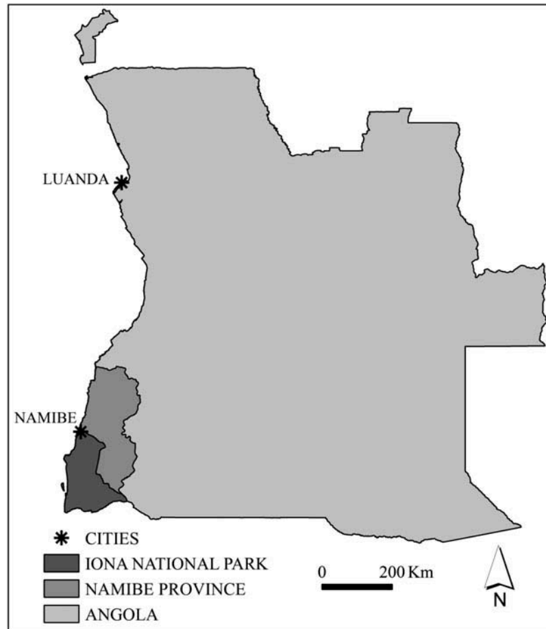
Figure 1. Iona National Park is located in Namibe province, southwest Angola. The Park is bordered by the Atlantic Ocean and lies between the Curoca River and the Cunene River.

as the emblematic black rhinoceros ( Diceros bicornis ), which is a critically endangered species worldwide (Emslie, 2012). Recently, governmental and non-governmental organizations across southern Africa have joined efforts to ensure the population recovery of other iconic species such as the African wild dog ( Lycaon pictus ) and the cheetah ( Acinonyx jubatus ) (e.g. The Range Wide Conservation Program for Cheetah and African Wild Dogs). Success has already been achieved in Iona National Park with regard to the cheetah, as the return of this species to some areas of historic occurrence has recently been confirmed (CCF, 2014). A growing number of species preyed upon by large carnivores, including springbok ( Antidorcas marsupialis ) and oryx ( Oryx gazelle ), two species that are well adapted to the arid environment, is also a good news for nature-based tourism, particularly wildlife tourism. In terms of tourist facilities and qualified staff, the improvements to Iona National Park have been less consistent. However, the recent introduction of a corps of 11 guards with specific training is a firm step in the right direction.