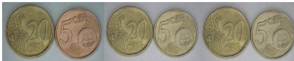
Figure 2. (Left) photograph of 20 and 5 eurocent coins; (centre) simulation of how a deuteranope observer would see these two coins; (right) simulation of how a protanope observer would see them.

This indicates that the two coins would be perceived as having the same tone by deuteranope observers, and that the differences that protanope type dichromats would observe will be minimal. This therefore opens up the possibility of using these coins as a new type of test for red-green color deficiency. To study how equally anomalous observers would perceive the two classes of coin, we applied a simulation algorithm of the two types of deficiency, deuteranope and protanope [7], on a picture of two coins of different color. The variability in the luminosity from the different zones of the coins due to the irregularities in their surfaces made it difficult to obtain this picture. The best image was obtained using a digital camera and avoiding reflections in so far as possible. The result is shown in Fig. 2.