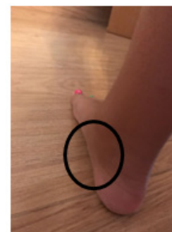
FPI 4. Prominence of the talonavicular joint