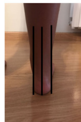
FPI 6. Abduction/adduction of the forefoot on the rearfoot