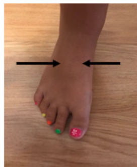
FPI 1. Talar head palpation

FPI measurements were assessed at baseline and repeated 36 months later, following the methodology of previous studies [32,36–39] by the same podiatrist (P.A.G). The FPI results shown in the study are for the right foot, which was chosen by randomization, although data from both feet were evaluated [32]. This index assesses the following criteria (Figure 1): talar head palpation, supra/inframalleolar curvature, calcaneal frontal plane position, prominence in the region of the talonavicular joint, congruence of the medial longitudinal arch, and abduction/adduction of the forefoot on the rearfoot. For each criterion, the score ranges from -2 to +2 . The total score obtained from the sum of the six criteria classifies the static posture of the foot into: highly pronated (10 to 12), pronated (6 to 9), neutral (0 to 5), supinated ( -4 to -1 ), and highly supinated ( -12 to -5 ).