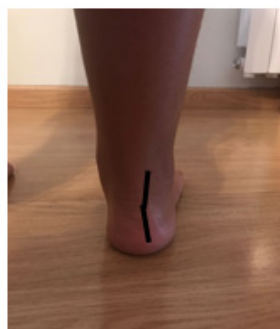
FPI 3. Calcaneal inversión/eversion