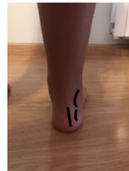
FPI 2. Supra/inframalleolar curvature