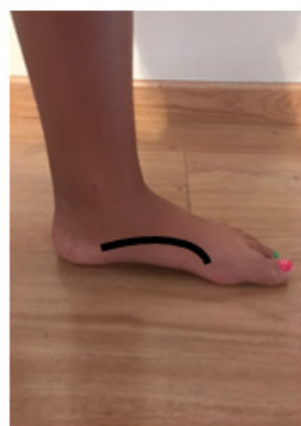
FPI 5. Congruence of the internal longitudinal arch