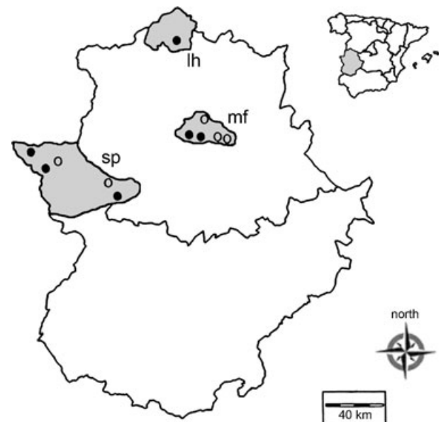
Fig. 1. Map showing the location of areas where wild boar was sampled for exploring the role of host, environmental and human management risk factors on the probability of B. suis bv2 infection in the region of Extremadura, south-western Spain. (SP, Sierra de San Pedro; MF, Monfragüe; LH, Las Hurdes). Solid dots represent estates with domestic pig farms; circles represent estate without pig farms. Small map in the upper right corner represents the localization of the studied area within Spain.

This population parameter was estimated in summer by counting the maximum number of boars per counting session (4 h previous to nightfall) observed in pre-determined open areas. In these places, boars are baited every week with