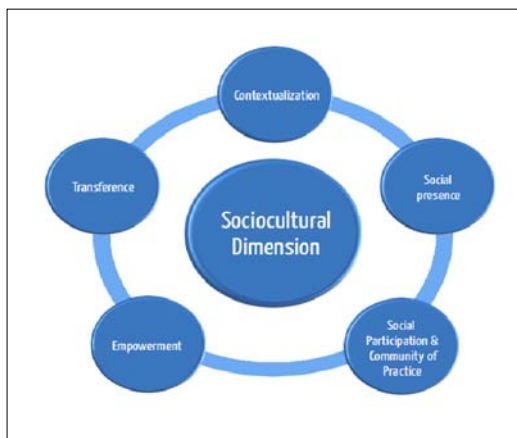
Figure 3. Socio-cultural dimension.

The main conclusions and contributions of this complete study refer to five aspects. In the first place, we contribute to a contextualisation and bibliographical revision of e-learning and new keys to the analysis of the factors determining social e-learning in a CSCL context. Secondly, from the approach adopted it is concluded that in order to form Communities of Practice by means of the VTLE a didactic model based on participation, motivation, and learning/interaction should be adopted. This model should justify itself from a globalising and integrating perspective that is constructivist in nature. Thirdly, from the analysis carried out based on the «social, teaching, and cognitive presence» model it can be inferred that a strong sense of community increases the students' participation in the formative action. It can be concluded that the messages referring to cohesion show that identification with the community and the integration of the students within it is generated (it forms the shared repository of the Communities of Practice) and that the interventions carried out outside the course fulfil an important social function (the mutual commitment and the joint enterprise that characterise the Communities of Practice are constituted). The categories of the analytical model cross over the three dimensions, with the «Social Presence» being that establishing the basis