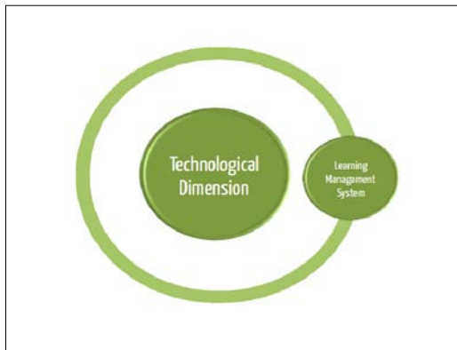
Figure 4. Technological dimension.