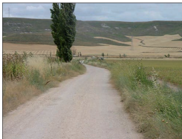
Figure 3. Low volume road paved with macadam.

During this era great part of the low volume roads were constructed in rain-fed lands, where the profit made per hectare was much lower than in irrigated areas. The use of stabilised granular materials was therefore relatively more expensive in these areas. Alternative solutions using available local materials were therefore sought, and consequently the low volume roads made in these areas differed in quality depending on their importance within the network. Main roads were made by using the best materials. Otherwise, some secondary roads were made employing better techniques, but many secondary and all tertiary roads were constructed in a more rudimentary fashion. Indeed,