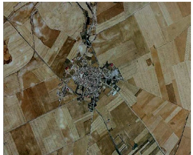
Figure 2. Low volume roads in a dry land area of Spain. Tree system.