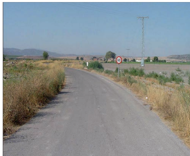
Figure 4. Low volume road paved with a double surface treatment.

Low volume road networks were mainly designed to provide access to farming operations, which is an eminently private enterprise restricted to the primary sector. The planning of the network followed a traditional top-down policy, which has been typically implemented in developing regions after Second World War (Njenga and Davis, 2003). The central planning defined areas of prior interest where low volume road network should be constructed in order to modernise agriculture there. Thus, the needs and desires of local population were not considered in many cases. This caused the perception in the final users that they had not any responsibility in the maintenance of the roads.